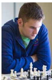
FM Dusan Stojic