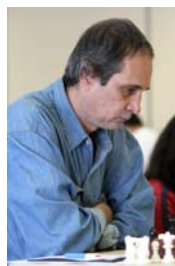
FM Abdulwahab Rashid